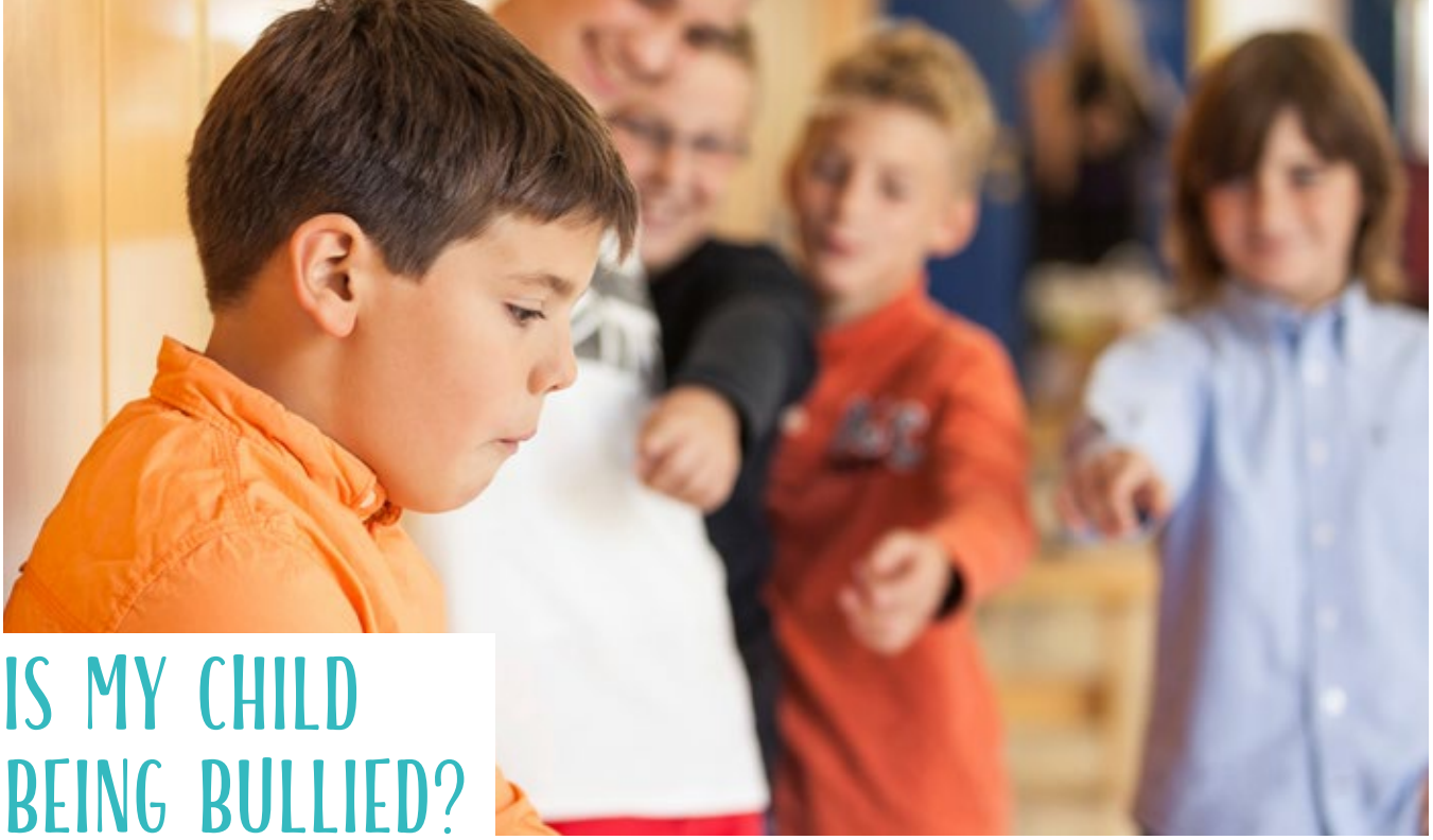
FUNSTOCK - ISTOCK - THINKSTOCK